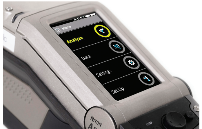
The Thermo Scientific™ Niton™ Apollo™ LIBS analyzer.