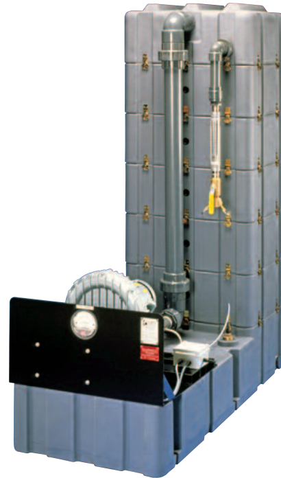
Geotech LO-PRO™ Model II

Contaminated water enters the Geotech LO-PRO™ at the top of the unit and cascades onto the first of a series of stainless steel bubble plates. A baffle in the center of each plate redirects the water 180° in each stage as it flows downward, alternating between clockwise and counter clockwise directions. This action optimizes the residence time of the water in the Geotech LO-PRO™, allowing for efficient contaminant removal.